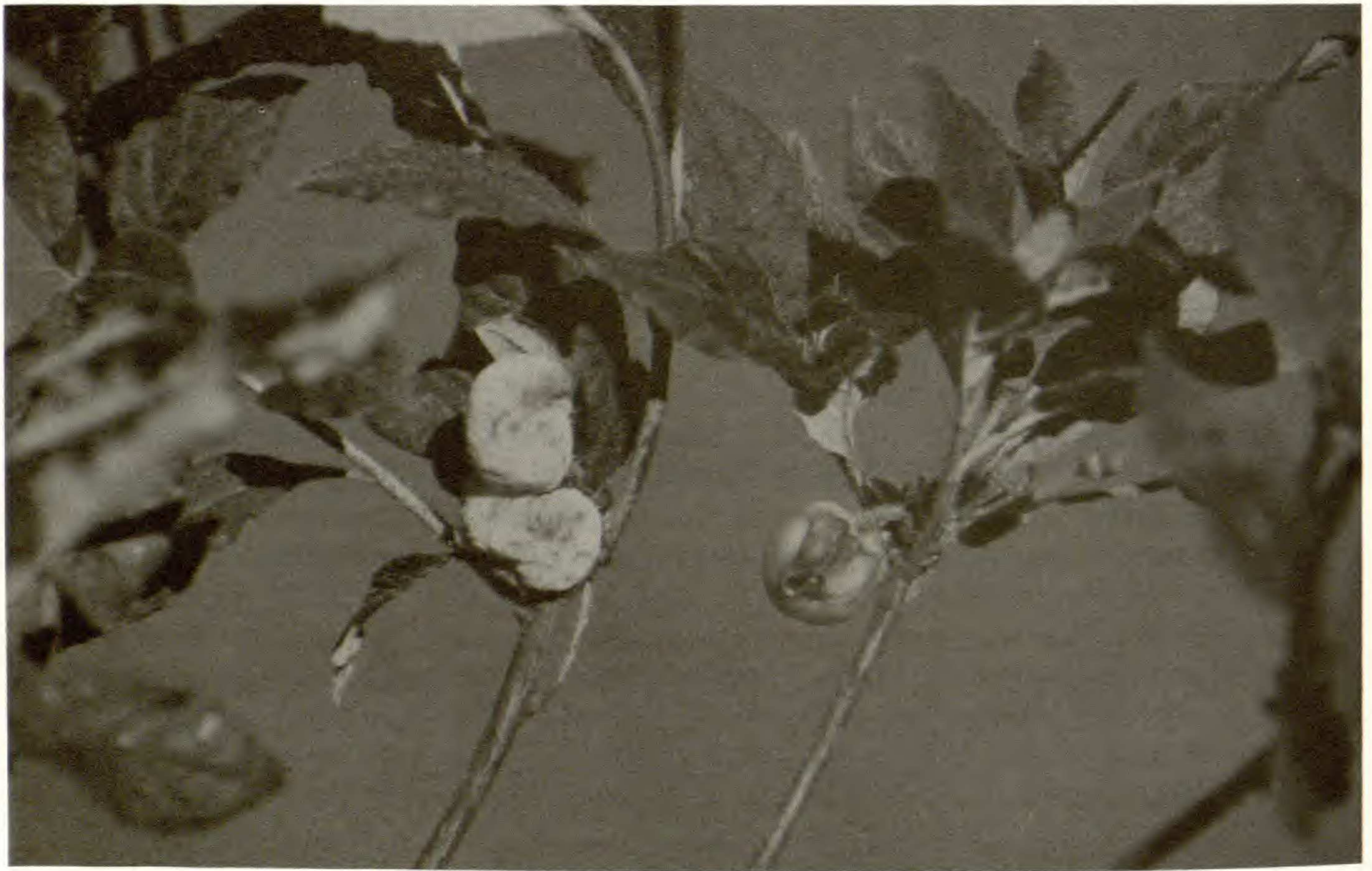
FIG. 1.—The “berries” of fool’s huckleberry: Exobasidium sp. affin. vaccinii infection resulting in deformation and hypertrophy of leaves and flowers of Menziesia ferruginea.

ληῖῖῖ/Ḫowekyala ληῖῖῖ has red or purplish berries can thus be attributed to the morphological characteristics of E. sp. affin. vaccinii and the host response to its infection.